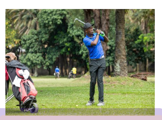
Nig-Brit Golf Tournament