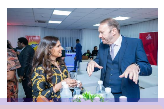
British Business Cocktail