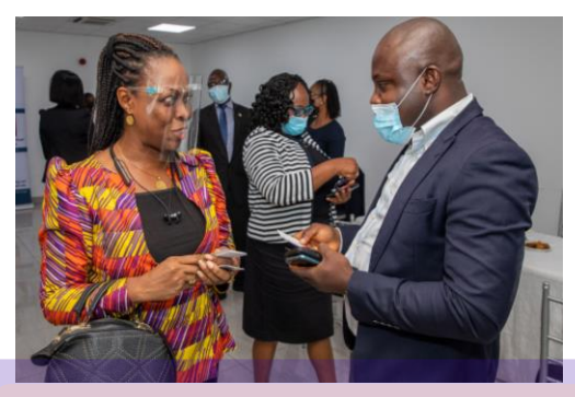
Speed Networking Event