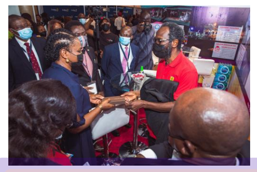
Conference & Exhibition