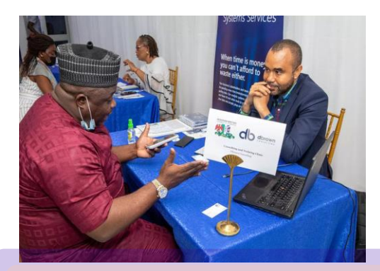
MSME Business Clinic